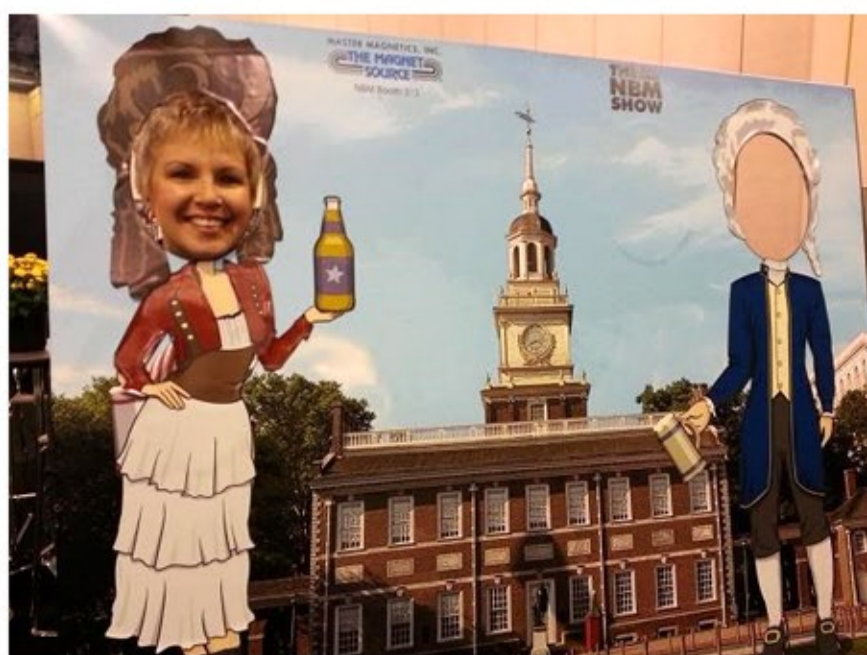
Show attendees could mix and match outfits and props, allowing for a hands-on demonstration of the magnetic graphics system.